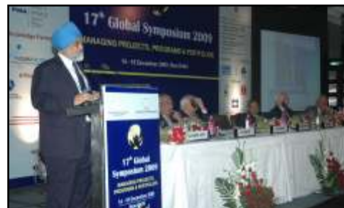
(2009) Montek Singh Ahluwalia, Hon'ble Dy. Chairman, Planning Commission, giving the Inaugural Address.