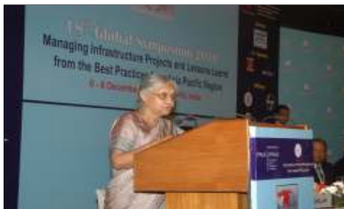
(2010) Smt. Sheila Dikshit, Hon'ble Chief Minister of Delhi giving the Inaugural Address