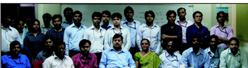
Participants of PDIL with the Faculty sitting in the centre.

Centre for Excellence in Project Management conducted a one day program on November 9, 2009 for the executives and managers of Project and Development of India Limited (PDIL). The topics covered were: Project & Program Management, Planning Management, Scope Management, Time Management, Cost Management, Risk Management and Communication Management.